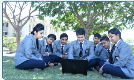
Wi-Fi Enabled Campus