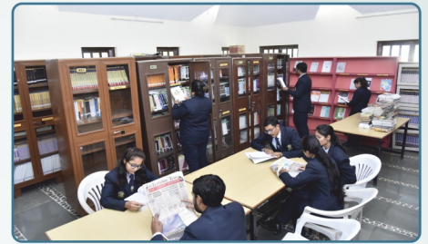
Well Equipped Library