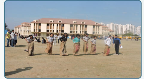
Huge Play Ground